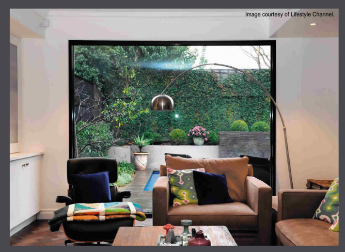
As seen on Deadline Design with Shaynna Blaze, Blackburn episode.

WE SPECIALISE IN ALUMINIUM WINDOWS & DOORS FOR: New homes